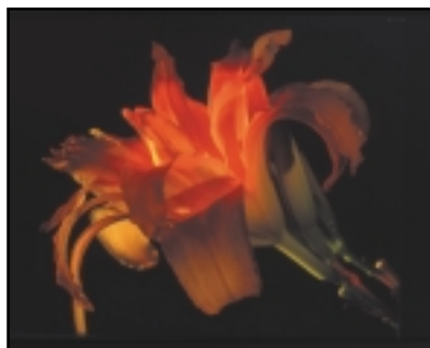
Ilya Faden 'Night Lily' Photograph

Midsummer Arts Faire c/o Historic Quincy Business District 510 Maine, Suite 300 Quincy, IL 62301